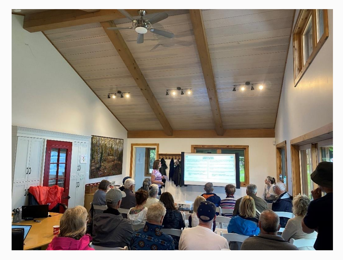
Public consultation @ PLTN, June 17th, 2023

Through this project, which was presented to citizens during two public consultations last June (see photo below), the municipality continues to pursue its conservation efforts in response to the concerns expressed by citizens in terms of Lac-Tremblant-Nord's environmental protection.